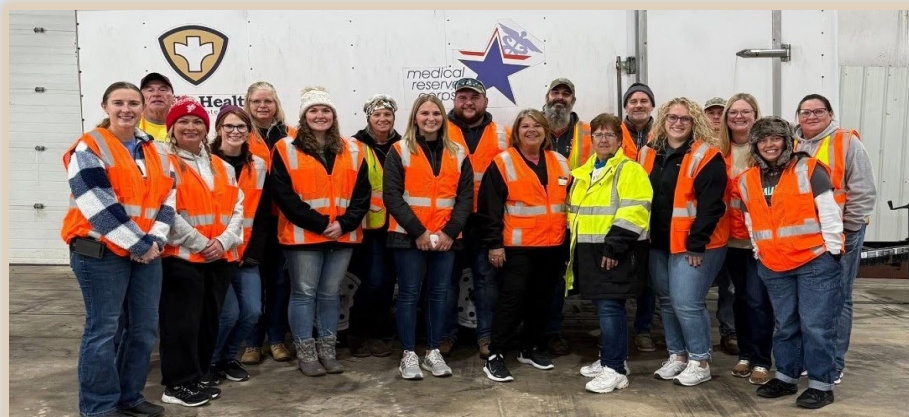
PCHD Staff at the 2025 Annual Drive-Thru Flu Clinic