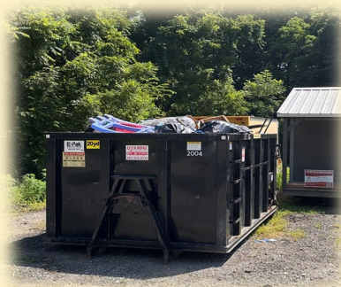
Leckrone Dumpster located in Hemlock

Two Community Cleanups were recently completed in Perry County. A dumpster was provided by From's Dumpster Rental, LLC at a Somerset location and another was provided by Leckrone Sanitation at a Hemlock location.