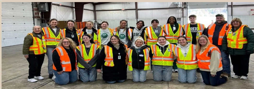
PCHD Staff and Ohio State University Zanesville Nursing Student Volunteers at the 2025 Annual Drive-Thru Flu Clinic

From our staff, to our student volunteers and instructors, and all of the patients who braved the cold to receive their flu vaccine- we appreciate you!