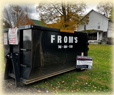
From's Dumpster located in Somerset